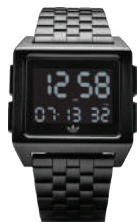
All Black 001