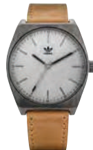
Gunmetal / Gray / Bone 2916