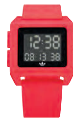
Shock Red 3120