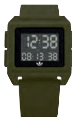
Raw Khaki 3118