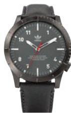
Gunmetal / Charcoal 2915