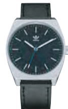
Silver / Black 625