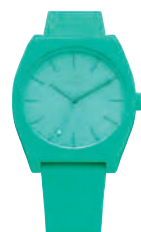
Hi-Res Green 3124