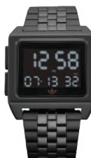
All Black / Copper 3077