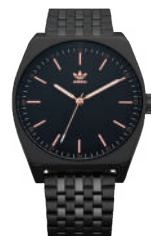
All Black / Copper 3077