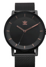
All Black / Copper 3077