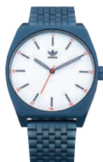
Navy / Silver Sunray Red 3032