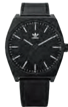
All Black / White 756