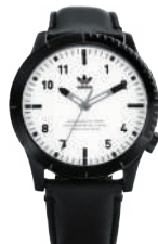
Black / White 005