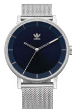
Silver / Navy Sunray 2928