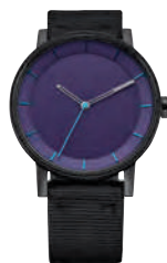
Black / Legend Purple 3182