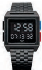
All Black / Blue / Red 3042