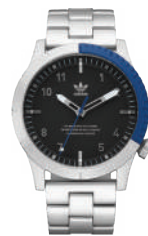
Silver / Black Blue 2184