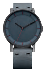
Gunmetal / Legend Ivy 3183