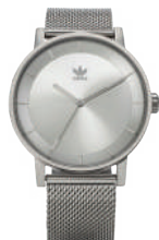
All Silver 1920