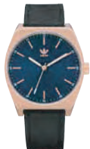
Rose Gold / Navy Sunray / Black 2967