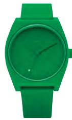
All Green 2905