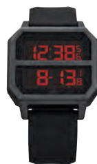
All Black / Red 760