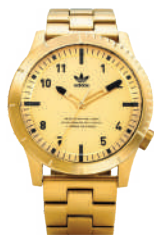
All Gold / Black 510