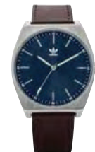
Silver / Navy Sun ray / Dark Brown 2920