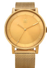
All Gold 502