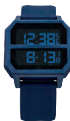
All Navy 605