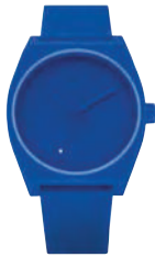
All Blue 2490