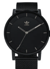
All Black / Gunmetal 2341