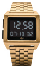
Gold / Black 513