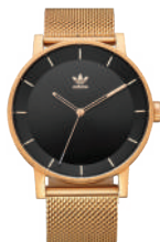
Gold / Black Sunray 1604