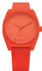
Active Orange 3127