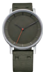
Silver / Raw Khaki 3181