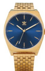
Gold / Navy Sunray 2913