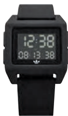
All Black 001