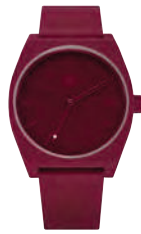
All Collegiate Burgundy 2902