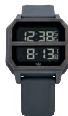
All Gunmetal 632