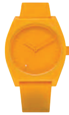
All Collegiate Gold 2903