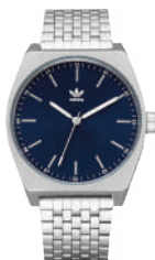
Silver / Navy Sunray 2928