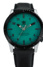
Silver / Subgreen / Black 2960