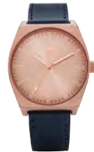
All Rose Gold / Navy 2908