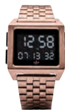
Rose Gold / Black 1098