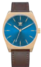
Gold / Blue Sunray / Dark Brown 2959