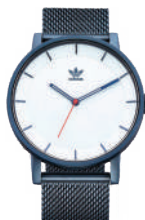
Navy / Silver Sunray Red 3032