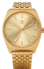
All Gold 502