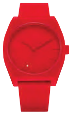
All Red 191