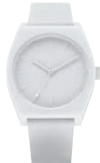
All White 126