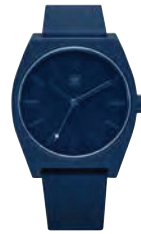
All Collegiate Navy 2904