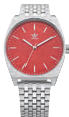
Silver / Raw Amber 3180