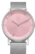
Silver / Light Pink Sunray 3035