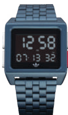
Navy / Black / Silver / Red 3041