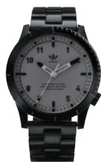
Black / Charcoal 017