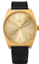
All Gold / Black 510