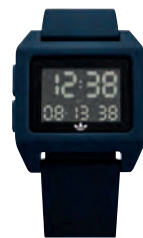
Legend Marine 3122