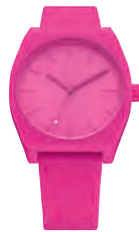
Shock Pink 3123