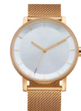
Gold / Silver Sunray 3034