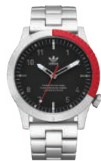
Silver / Black Red 2958