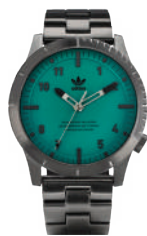
Gunmetal / Subgreen 2917