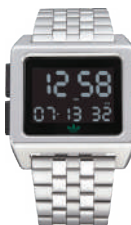
Silver / Black / Green 3043