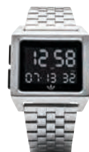
Silver / Black / Blue / Red 2924