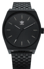
All Black 001