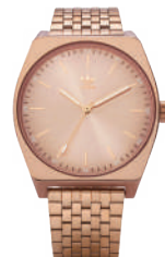
All Rose Gold 897