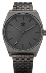
All Gunmetal / Black 680