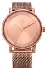
All Rose Gold 897