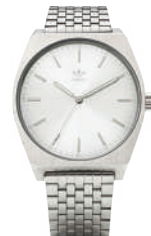
All Silver 1920