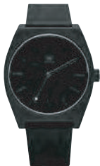
All Black 001